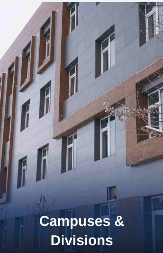
Campuses & Divisions

mountains. The information on academic performance and attendance of students is made available on the school's website each semester to make sure the training process is transparent. IHSM provides accommodation in hostels with modern facilities. Hostels have access to internet services and students are protected by special Security agencies