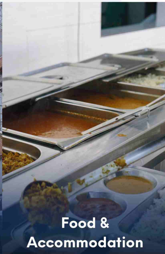
Food & Accommodation