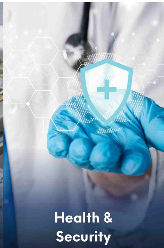
Health & Security